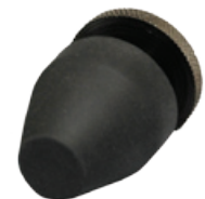
Rubber Feet (4)

The P-1200 is shipped with adjustable feet, (4 spiked and 4 rubber) with tool-less knurled jam nuts. These feet can be installed in the bottom of the enclosure in either a 3-point triangular pattern or a more traditional 4-point square pattern. The bottom of the enclosure has 5 threaded inserts arranged to accept either pattern.