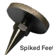
Spiked Feet (4)